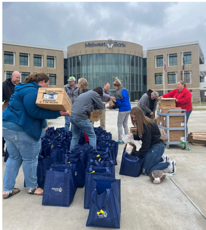
Employees helped put together meals at Midwest Bank for the Norfolk Public Schools' Thanksgiving Meals.